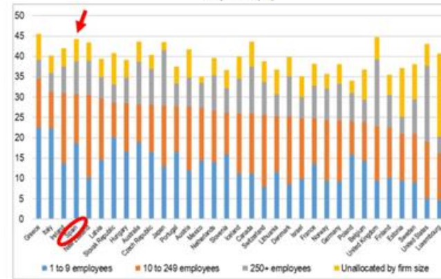
Proporción del total de empleo en los sectores más afectados, por tamaño de empresa (%)